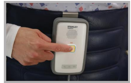
A wide array of mounting options allow the M200 to be affixed to a headboard, wall, wheelchair, side chair, or by a toilet.

For more than 30 years, STANLEY Healthcare has partnered with thousands of healthcare facilities. Across the U.S. and around the world, our innovative fall management solutions are helping improve patient and resident outcomes while enhancing caregiver efficiency. The M200 represents our most advanced fall management solution. It’s a compelling opportunity for your facility to take its program to another level in terms of quality, safety and efficiency. It’s also a way to support cost-saving goals—empowering you to reduce the incidence of falls (“never events”), purchase fewer monitors and drive operational efficiencies through greater standardization across your organization.