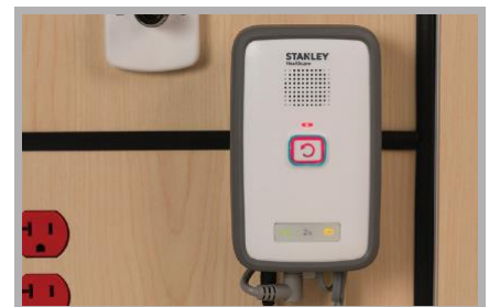
Audible and visual feedback confirms desired alarm settings and when an individual is actively being monitored.

Medical Technologies Int. is an authorized Sales Partner for Stanley Healthcare. For more information on this product or other Fall Management and Patient Safety products contact our office.