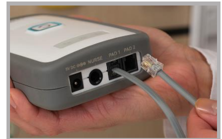
Connect two pads to a single monitor at the same time—no need to continually disconnect and reconnect pad cords.