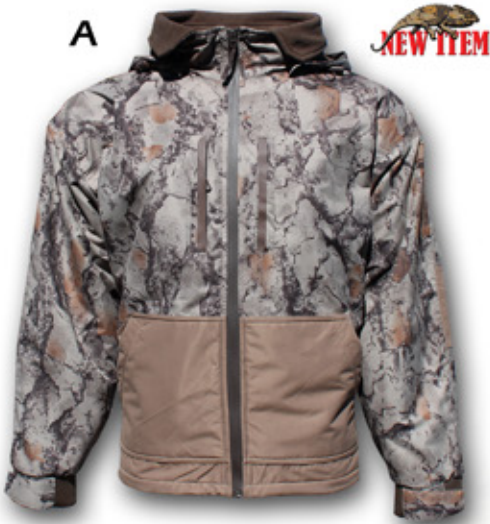
A Cut Down Waterfowl Jacket - 105