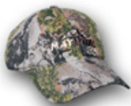
F. 511MB-SCII Cap