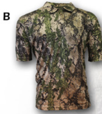
B Cool-Tech SS Polo Shirt - 534