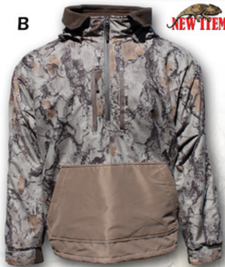
B Cut Down Waterfowl Pullover- 205