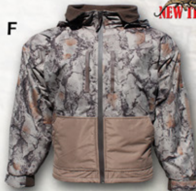
Youth Cutdown Waterfowl JKT