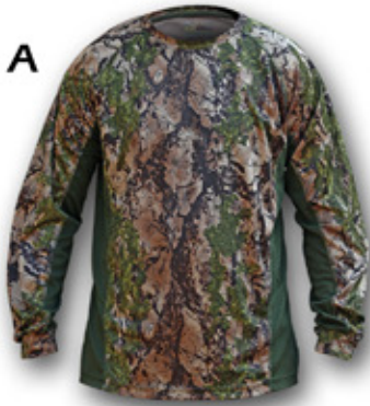
A Cool-Tech Performance Top - 501