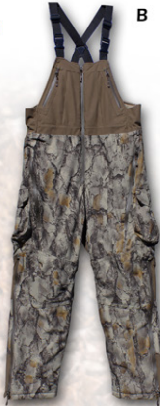
Stealth Hunter Grand Stand Bib