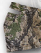
H. 533- SCII 3/4 Facemask.