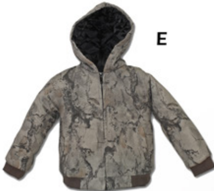
Toddler Bomber Jacket