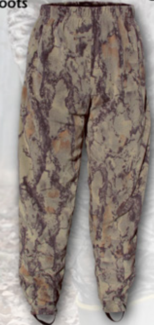
C. 108-Fleece Wader Pant