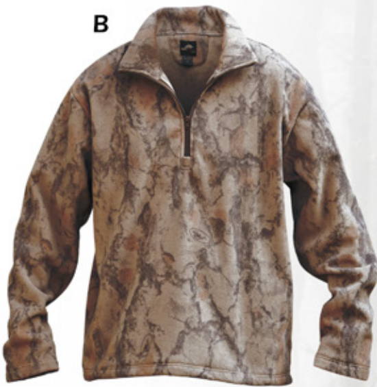
Layering Fleece Pullover - 151