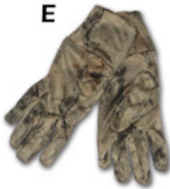
Stealth Fit Glove - 710 Stretch light weight glove (OSFM)