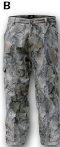
Youth Fatigue Pant