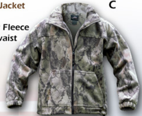
Youth Fleece Jacket