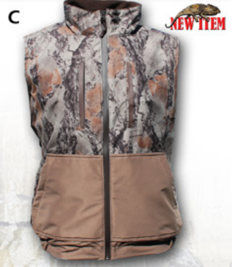
C Cut Down Waterfowl Vest- 264