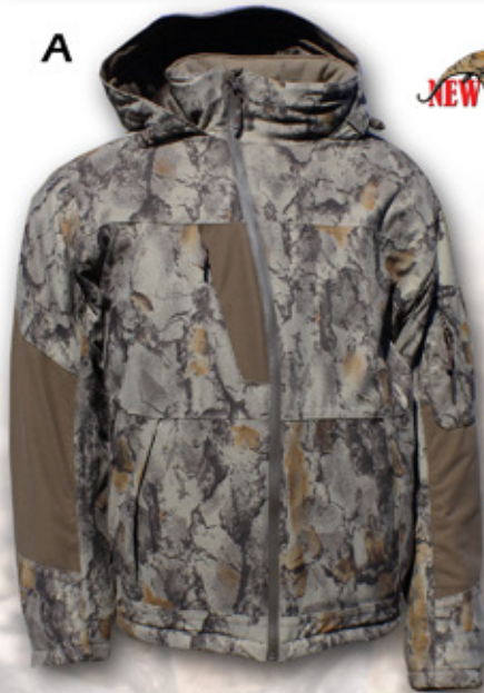
Stealth Hunter Grand Stand Parka