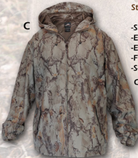
Stealth Hunter Series Rain Jacket