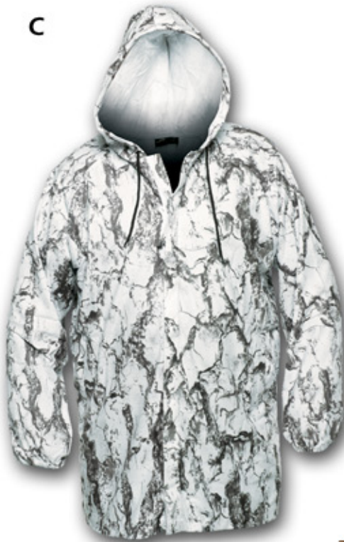
319-Snow Cover Up Parka