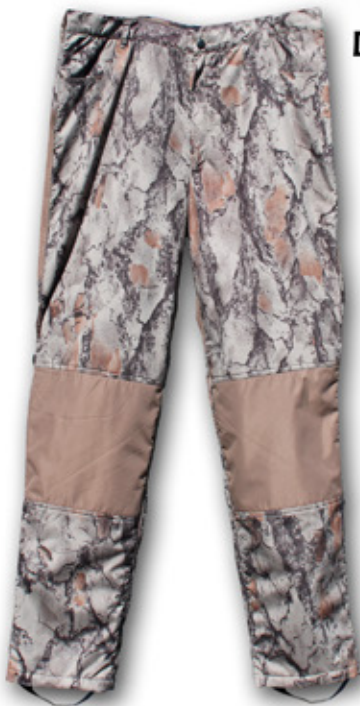
D NEW ITEM