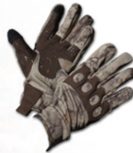
E. 810-Stealth Hunter Soft Shell Glove M/L or XL/XXL