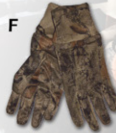
Mesh Glove - 610 Mesh backed glove (OSFM)