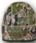
G. 531 - SCII Beanie