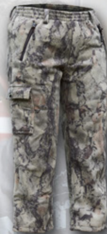
Youth Fleece Pants