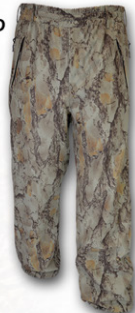
Stealth Hunter Series Rain Pant