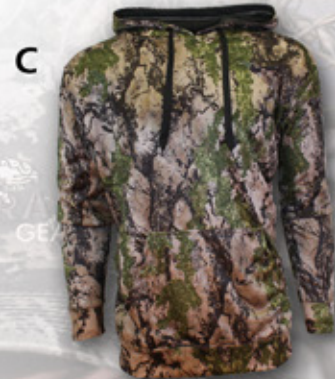
C Cool-Tech Hoodie - 561