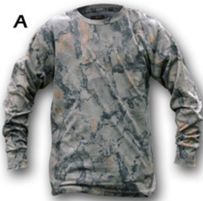
Youth Long Sleeved Tee