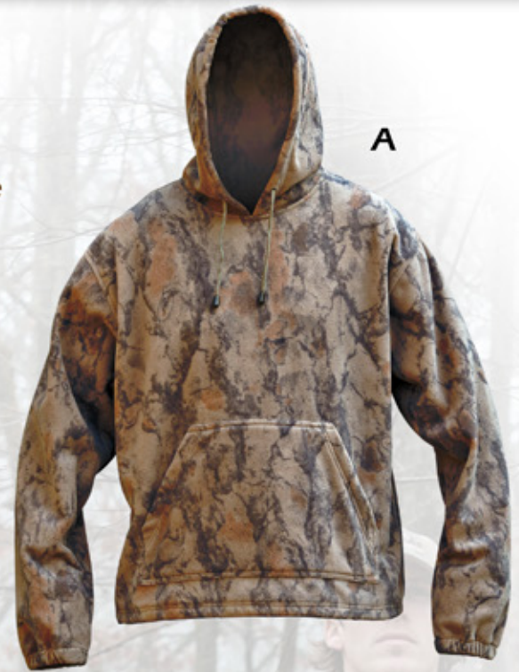
A. 161-Fleece Hoodie